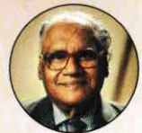
Receipient of 1 st "Vignatham" Award 2016 Bharat Ratna Dr. CNR Rao, FRS