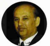
Receipient of 2 nd "Vignatham" Award 2017 Padma Vibhushan, Padma Bhushan Dr. UR Rao, FRS