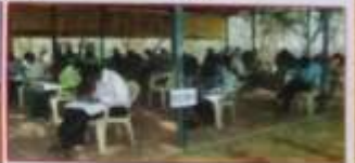
Common Entrance Exam